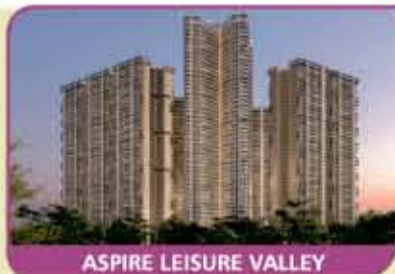
ASPIRE LEISURE VALLEY