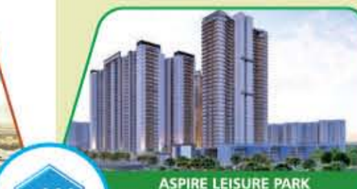
ASPIRE LEISURE PARK