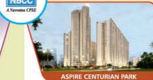
ASPIRE CENTURIAN PARK